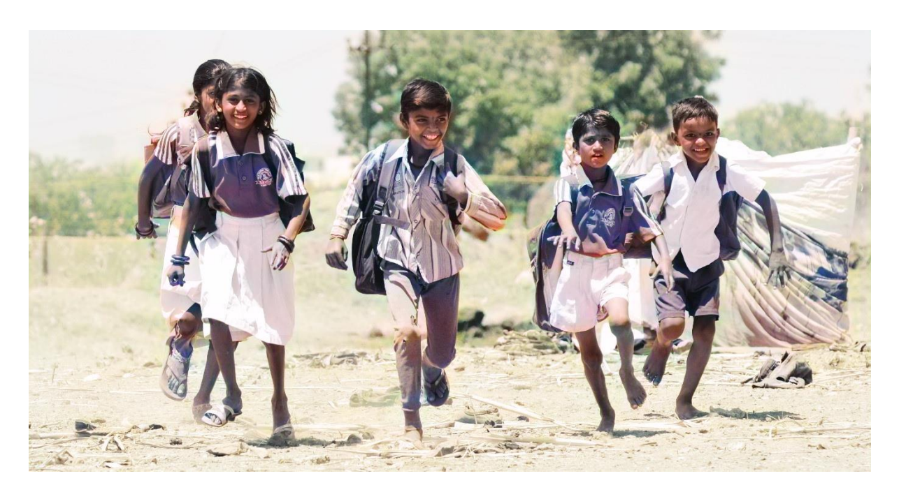
NGO: Door Step School Foundation, Pune

Door Step School Foundation is dedicated to combating illiteracy among children aged 3 to 14 years from marginalised communities, including those living on construction sites, pavements, temporary - permanent slums and seasonal migrants like those working in brick kilns and sugarcane factories. Through a range of innovative programs implemented across 500+ communities and 120+ government schools, DSSF positively impacts over 70,000 children every year in and around the Pune Metropolitan Region.