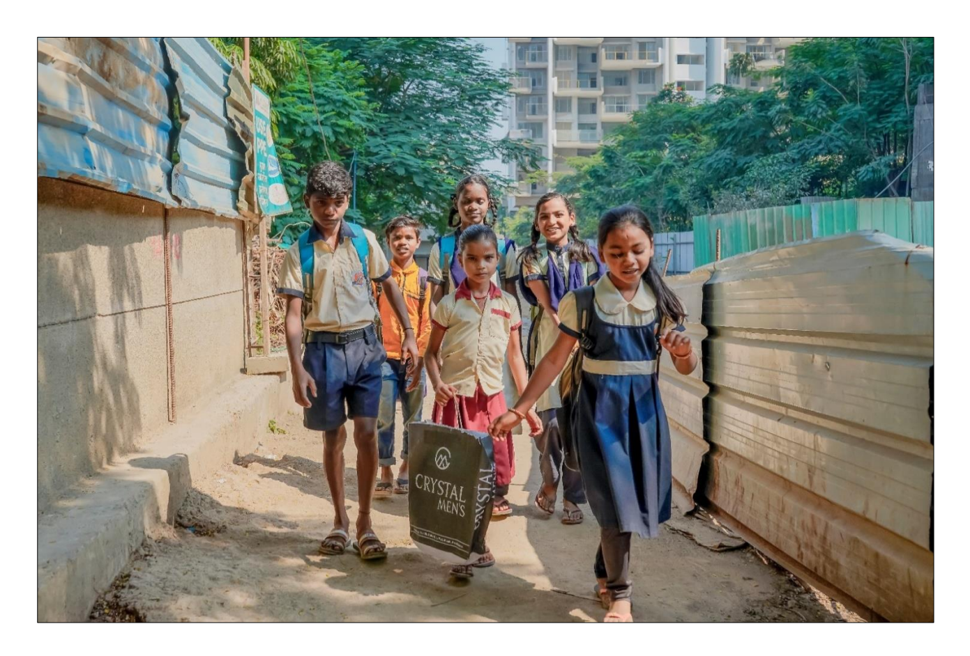
To know more click on the following link: www.dssf.org.in

Our dedicated team of over 600+ well-trained employees, supported by 500+ committed volunteers, CSR & funding partners and individual donors, all work together to ensure success of these programs reaching over 70,000 children annually in Pune.