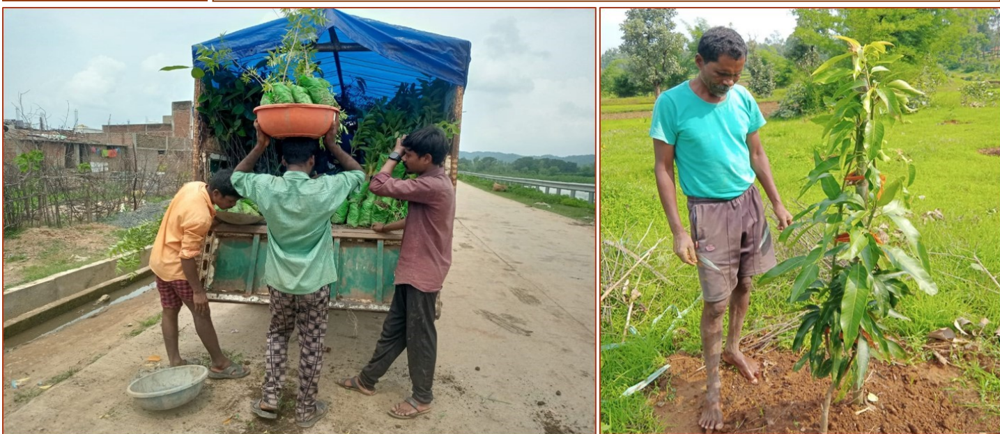
A Mobile App helps track the growth of 10,000 trees planted with IDRF's support in 46 villages of Chhattisgarh.