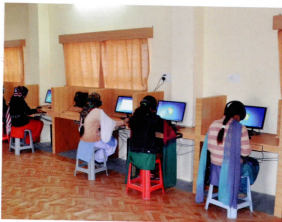
English lab in women's college