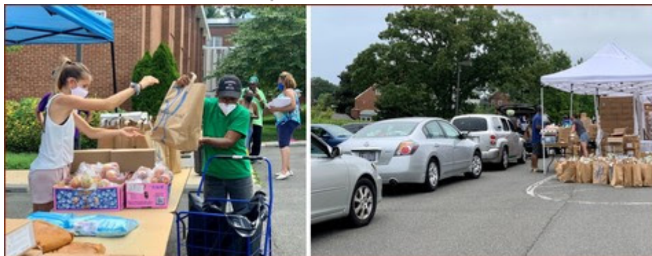
IDRF's COVID-19 Relief Campaign in the USA