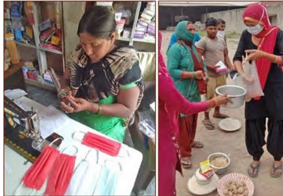
SHG members making face masks and providing food to the struggling families

government officials and the villagers in fight against coronavirus.