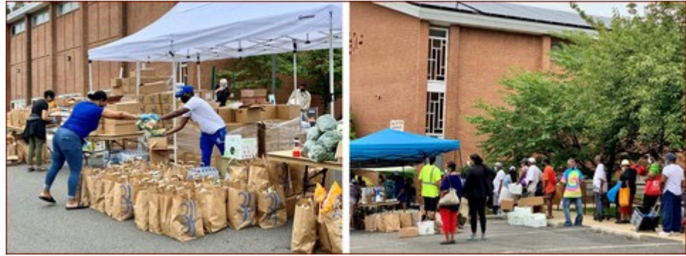
IDRF's COVID-19 Relief Campaign in the USA

Quarterly Newsletters June 2020 March 2020